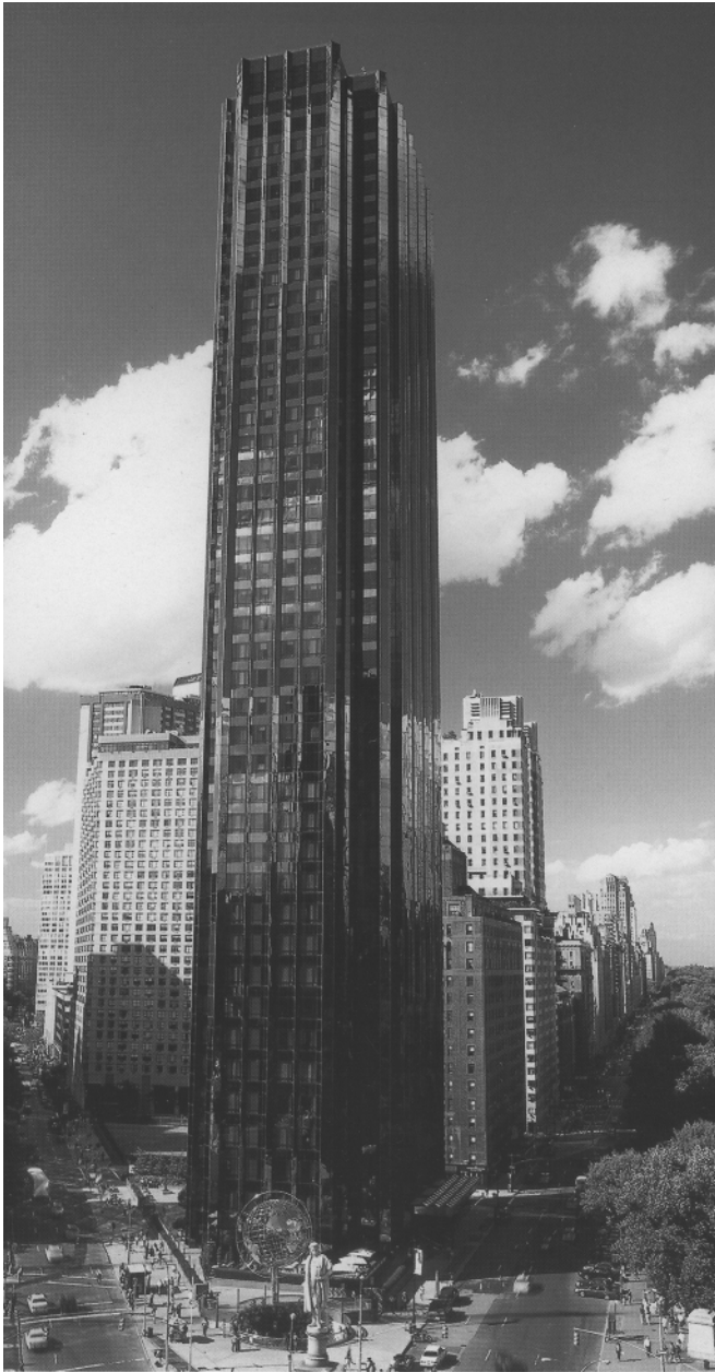
Trump International Hotel and Tower