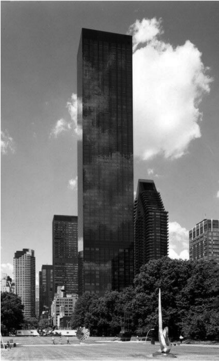
Trump World Tower at United Nations Plaza