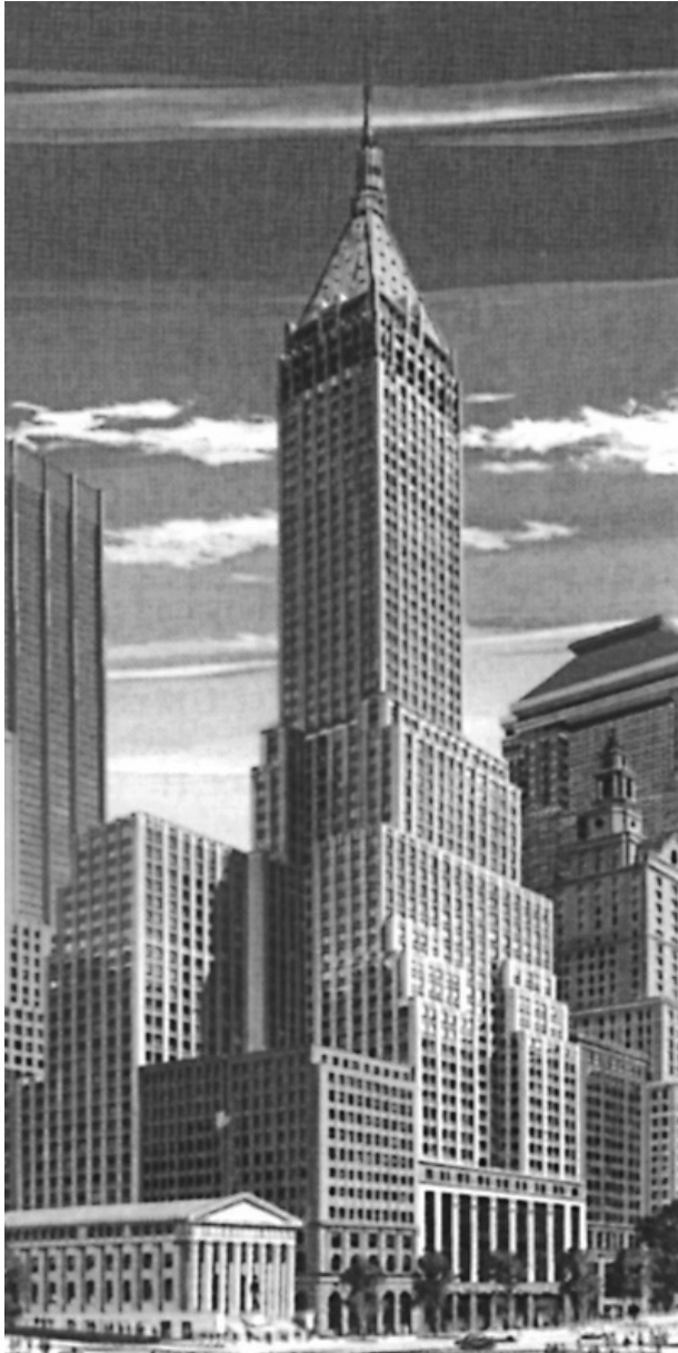
40 Wall Street