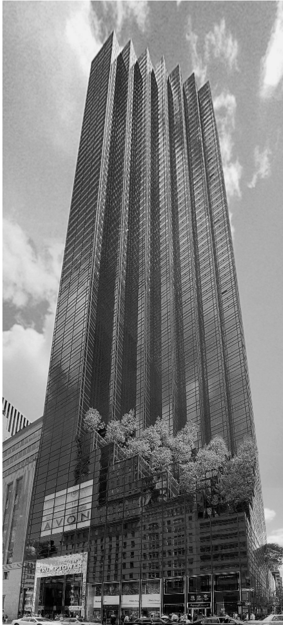
Trump Tower on 5th Avenue