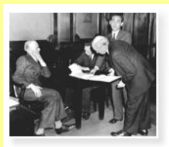
Jesse Livermore sits before the bankruptcy referee on May 15, 1934. Livermore always paid his bankruptcy creditors back when he got back on his feet, even though he was not legally responsible.