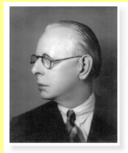
Jesse Livermore was a handsome and powerful man who cherished his secrecy and his private life. He moved in silence and mystery and was like catnip to women.