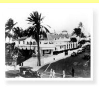
Bradley's Palm Beach "Beach Club"—the longest-running illegal gambling casino in America's history. Ed Bradley, the "greatest gambler" in America, and Jesse Livermore, the "greatest stock speculator" in America, were fast friends.