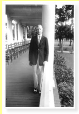
Jesse Livermore stands on the porch of the Breakers Hotel in Palm Beach where he took a large apartment every winter. He traveled to the Breakers in his private railway car and had his yacht sent down to Palm Beach ahead of his arrival.