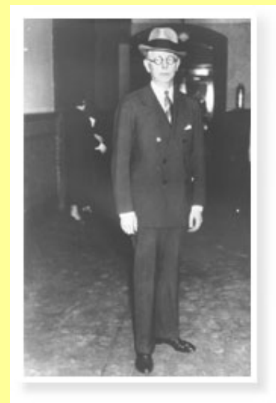
Livermore was subject to deep black depressions all his adult life, during success or failure. This photo was taken on November 26, 1940, two days before "The Great Bear" of Wall Street took his own life.