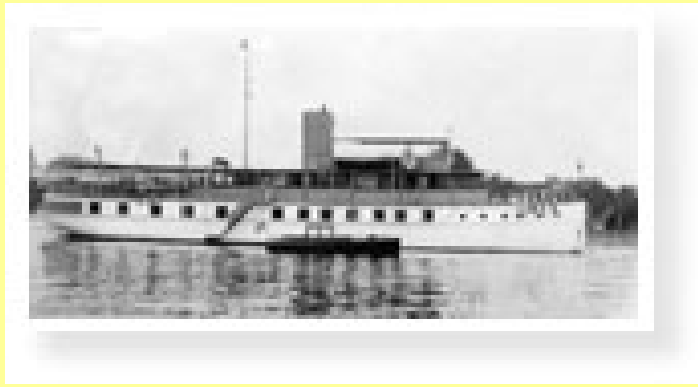
The original Anita Venetian with a 40-foot launch tied along side. Livermore loved yachting. In all there were 3 Anita Venetians —the last one was 300-foot long.