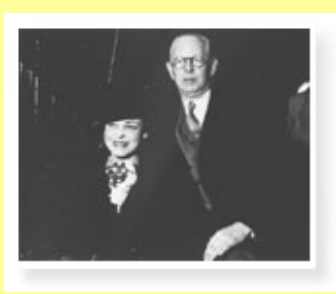
Jesse Livermore "The Boy Plunger" of Wall Street and his wife of twenty months set sail to Europe on the S.S. Rex after his 1934 bankruptcy. Before boarding Livermore said, "I hope to relieve my mind of some of my troubles."