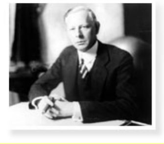
Jesse Livermore, the legendary "Boy Plunger" and "Great Bear of Wall Street" in his office in 1929 just after the "Crash"-- when he went short the market and made over 100 million dollars. His powers were at their highest. His life slid downhill from here--ten years later he would kill himself.