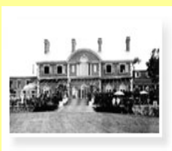
Livermore's mansion "Evermore" at King's Point Long Island. The dining room table sat 46 for dinner. There was a barbershop in the basement with a live-in barber. His 300-foot yacht was anchored in the back yard. The mansion was the scene of many grand parties—finally auctioned off—June 27th, 1933.