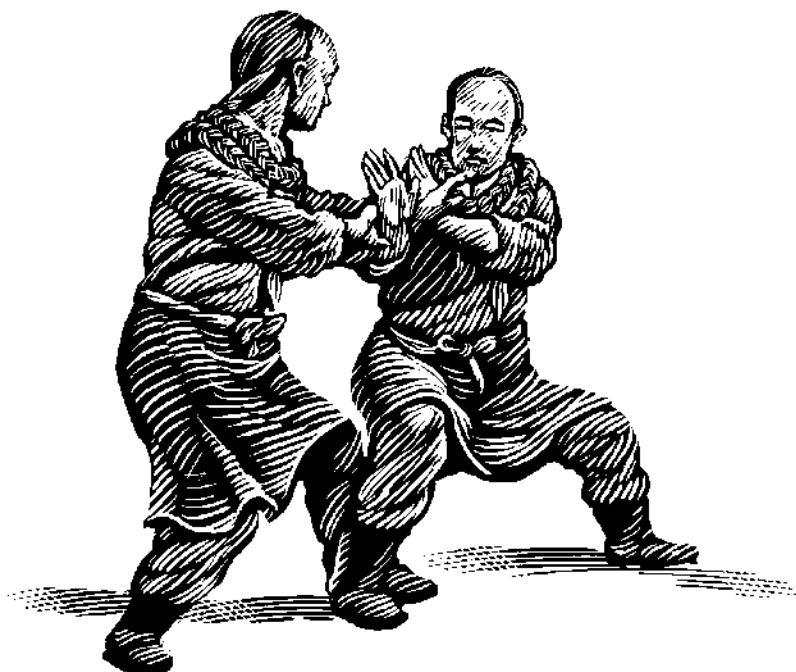
Tuishou: Zouhua and Niansui

The "Song of Push Hands," in its oral transfer of the art over centuries in Chen Village, instructs the competitor to "guide [the opponent's] power into emptiness, then immediately attack." 20 To guide or lure the opponent into emptiness and thus destroy his balance is the very