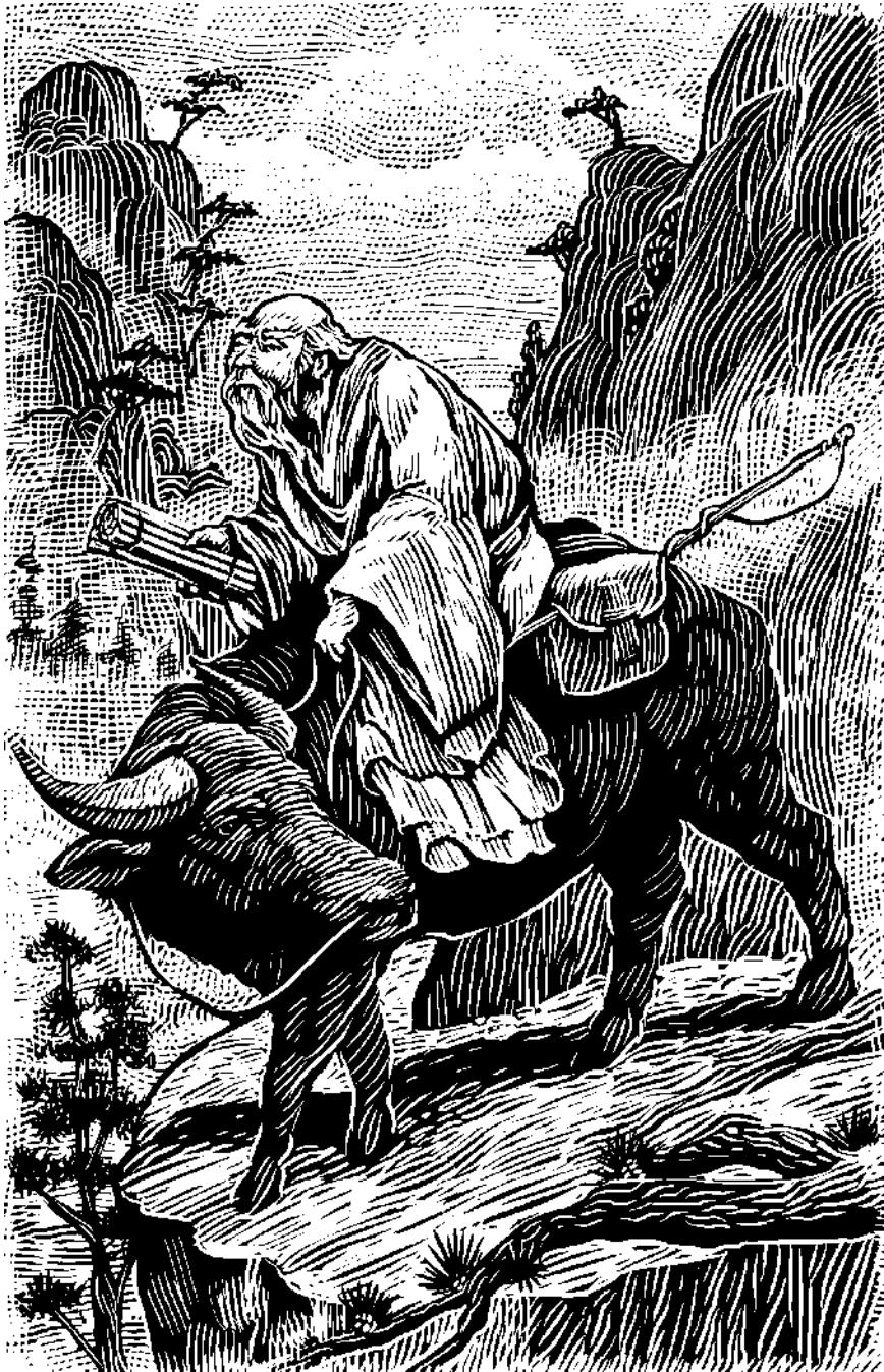
Laozi, "The Old Master," Retreats from the World, Leaving His Wisdom Behind